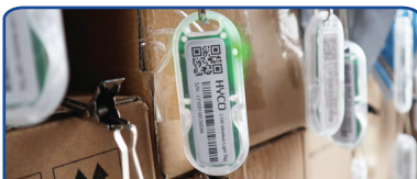
Delivery Service Station