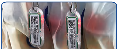
Takeaway - Pick Up